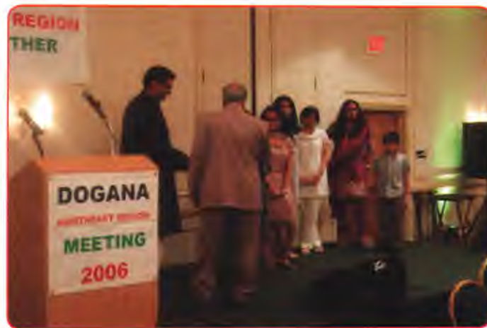
Children Receiving Awards