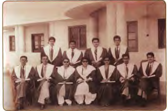
Academic awards winners of the 56 class after the graduating convocation