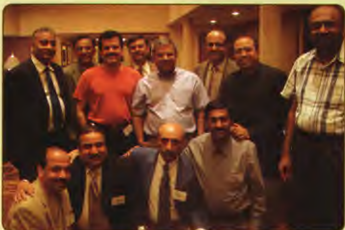
The Class of 1982