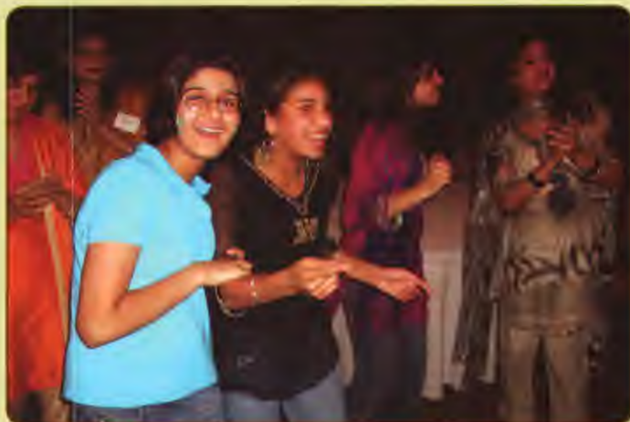
The Saturday musical evening was fun for everyone.