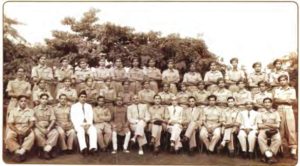
Karachi University UOTC contingent which participated in the Pakistan national Independence Day Parade in Karachi 1950.