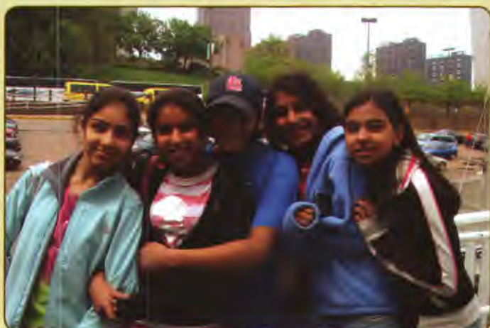
It was indeed fun for the children